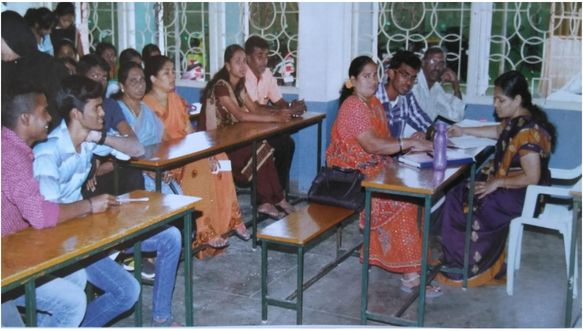
CLASS TUTOR INTERACTING WITH PARENTS