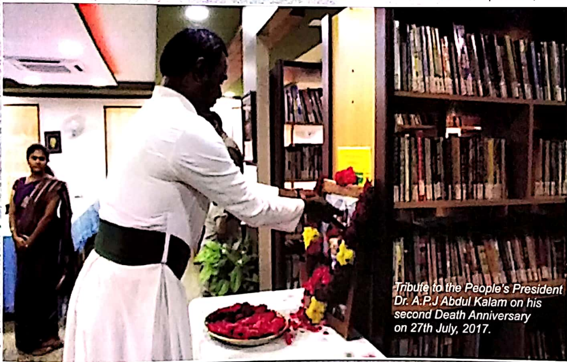
Tribute to the People's President Dr. A.P.J Abdul Kalam on his second Death Anniversary on 27th July, 2017.