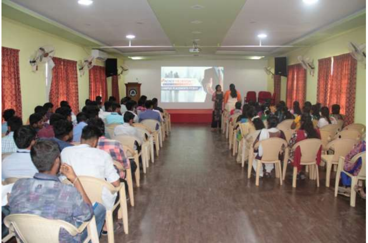
Pre placement presentation been given by ICICI team