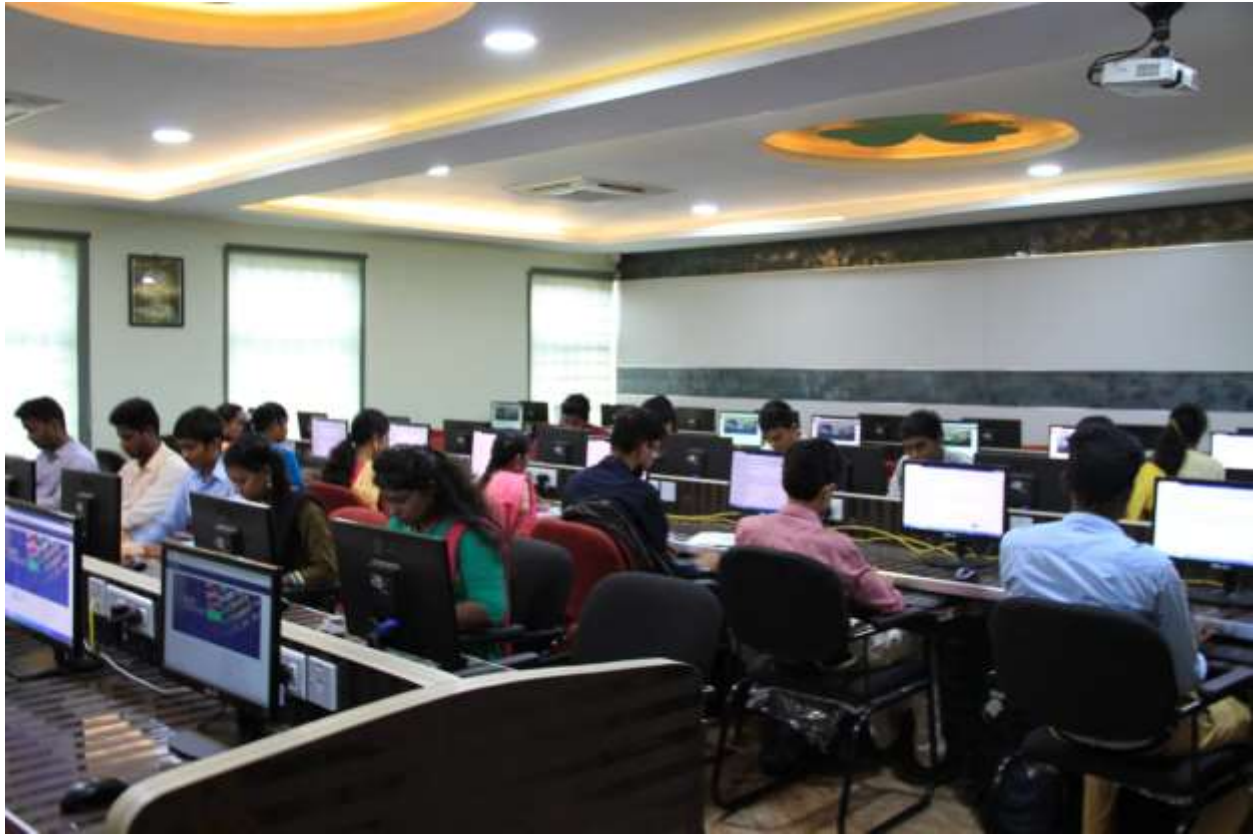
Students attending Online test during the interview process.