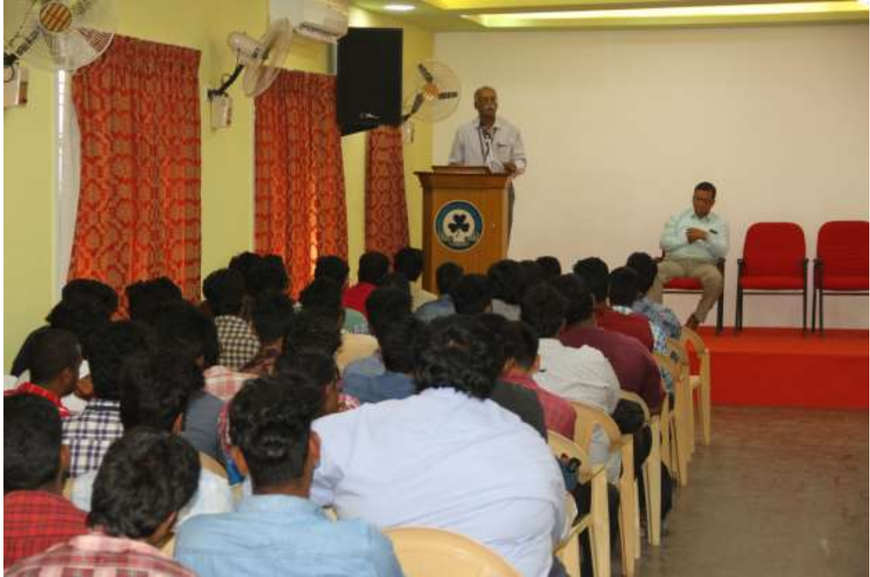
HR addressing the gathering