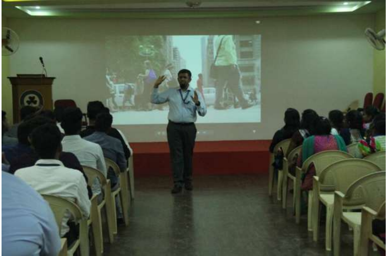
Pre placement talk by the Recruiter.