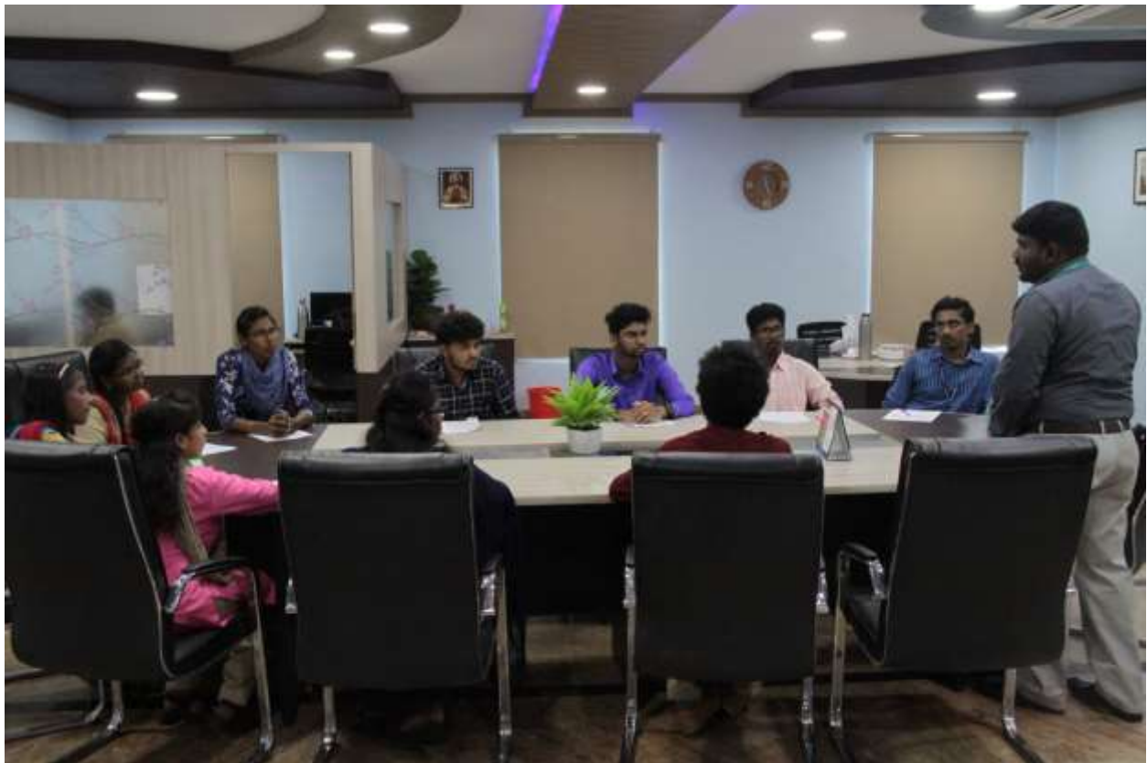
Students attending Group Discussion.

The placement season this year saw participation from major recruiters like Wipro, IndusInd Bank, RR Donnelley, TCS, Sutherland, Sundaram Finance, Just Dial, Zilker Technology, Infosys, Adecco, Website Learners to name a few. The process is set to wrap up on a high with the remaining students waiting to be interviewed with companies over the next few weeks. Students were offered various coveted roles in Analytics, Consulting, E-commerce, Banking and Technology Consulting.