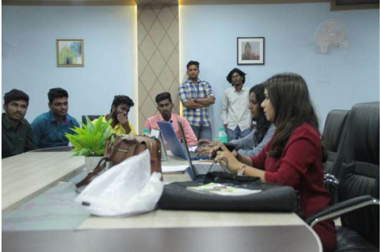
Face to Face interview being held at Source Hub