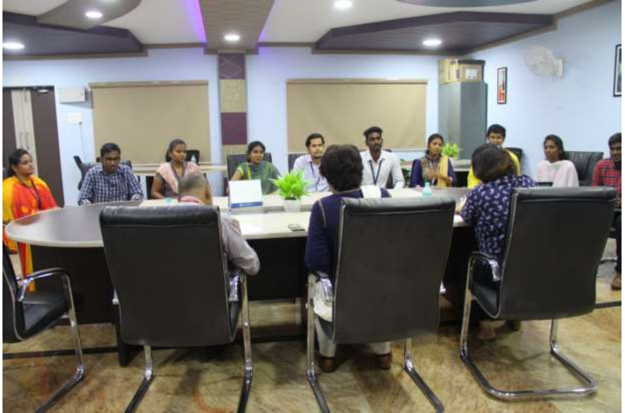
Students participating the Group Discussion.