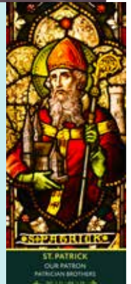
ST. PATRICK OUR PATRON PATRICIAN BROTHERS