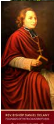
REV. BISHOP DANIEL DELANY FOUNDER OF PATRICIAN BROTHERS