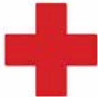
YOUTH RED CROSS (YRC) "To Serve"