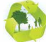
SUSTAINABLE DEVELOPMENT CENTRE (SDC) "Act Today, Sustain Tomorrow"