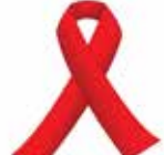
RED RIBBON CLUB (RRC) "Say Yes to Life, No to Drugs."